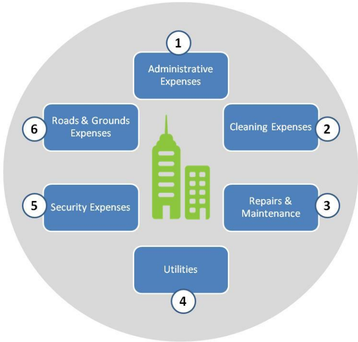
Typical Distribution of Facilities Operating Expenses